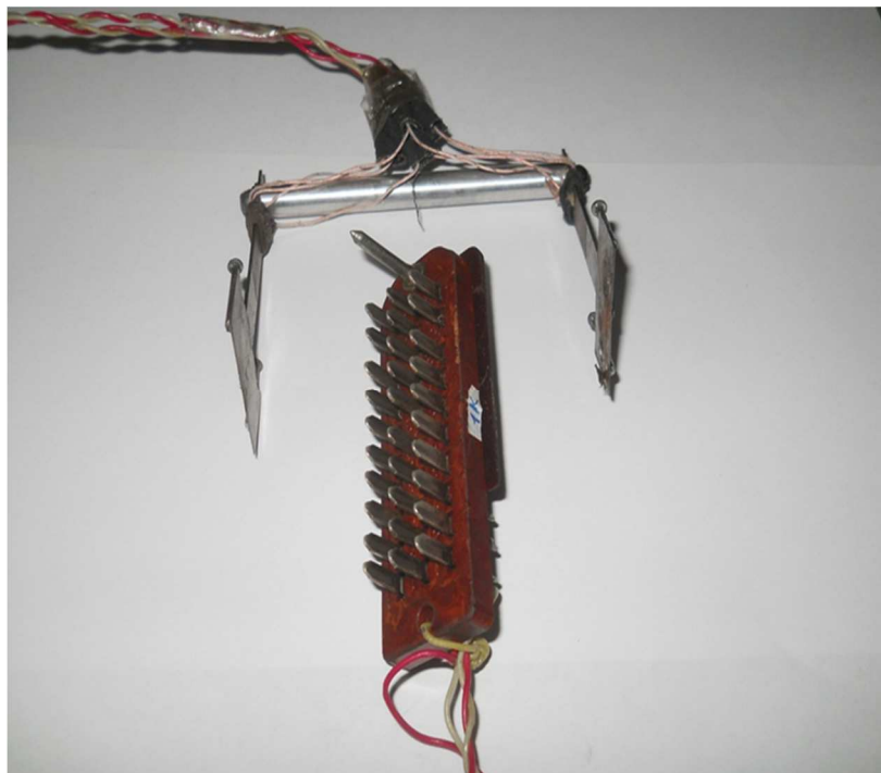
Fig. 2. Electromechanical strain gauge

Strain gauge was attached to sample with special elastic threads. In a case of changing the sample size as a result of its loading by compressive force the distance changed between the points of contact of strain gauge knives and sample cuts. At the same time there was a bending of elastic elements on which strain gages were glued. Before testing, the diameters of samples were measured, base of deformation measurements was marked and showed 80 and 100 mm.