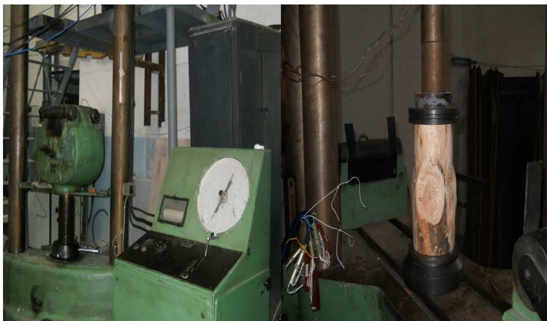
Fig. 1. Testing machine UMM-200

Elastic deformation of control samples was observed in the first cycle. These deformations gradually decreased during subsequent cycles of loading and disappeared after the 20 th cycle.