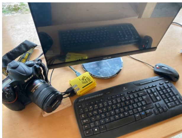
Fig. 5. The final set of the photo booth

The final set of the photo booth. In Fig. 5, we can see all the hardware components connected. The total cost of new components for the photo booth we have built (without the cabin) would be about 750 Euros. The estimated price of the photo booth cabin made of wood would be approximately 250 Euros. Its design is displayed in Fig. 6 – its dimensions are 60x60x23cm, estimated weight is about 13 kg.