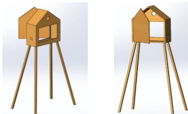
Fig. 6. Design of the case of the photo booth: front and back view

Our solution - software. The Python programming language was used to create a control program for our photo booth. It is a universal programming language that is used to create modern applications related to data analysis, media processing and other operations. This programming language works on various platforms such as Windows, Linux, Mac or even Raspbian. In our specific case, we used Python version 3.7.3 [8; 9; 10]. The resulting program has the task of providing communication between RPi, camera, monitor, mouse, keyboard, or printer, respectively implement photo sending to mail/internet storage. An important function is also communication with the user of the photo booth via the created GUI.