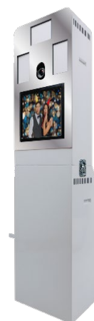
Fig. 3. Topfotobúdka FT1 [4]