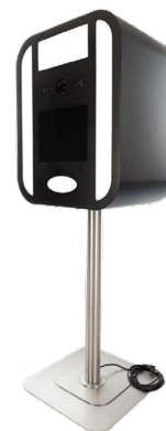
Fig. 2. FB-003 Classic [3]

The Raspberry Pi is a single-board low-cost microcomputer with a size 85×56 mm and approximately 20 mm thick, almost like a credit card. This small computer is an exposed motherboard on which hardware components are mounted, and its performance can be compared to a weaker desktop computer. It was designed primarily for teaching programming. Any operating system compatible with the ARM platform can be installed on it, but it must be taken into account that the RPi does not contain any hard disk or SSD disk. By connecting various external components, we can modify it for a specific environment and purpose [5].